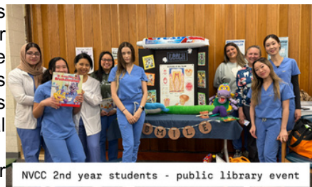
NVCC 2nd year students - public library event