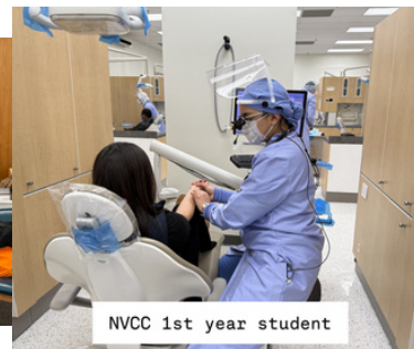
NVCC 1st year student