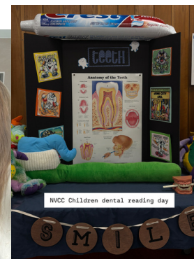
NVCC Children dental reading day