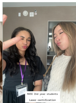
NVCC 2nd year students Laser certification